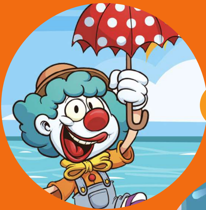
Clown Show (Zammour)

The shows, created by professionals, are designed to entertain children and enrich their cultural experience! Please see the scheduled shows below: