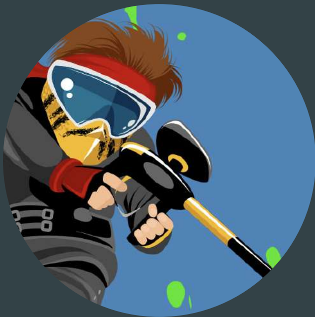
Gelvor Air Guns