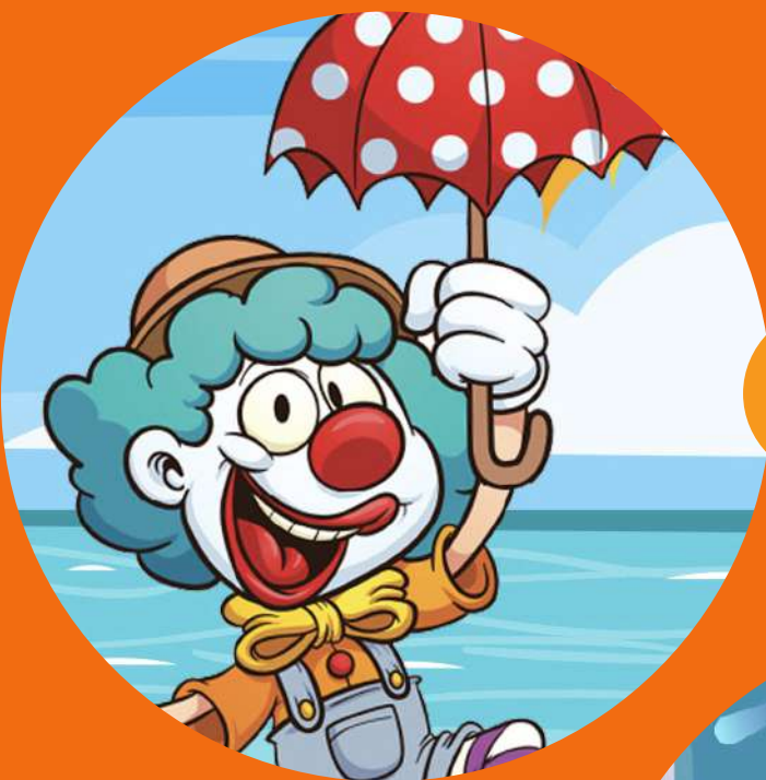
Clown Show (Zammour)

The shows, created by professionals, are designed to entertain children and enrich their cultural experience! Please see the scheduled shows below: